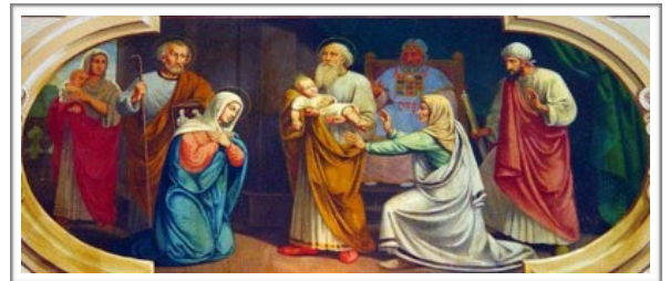
The Presentation in the Temple